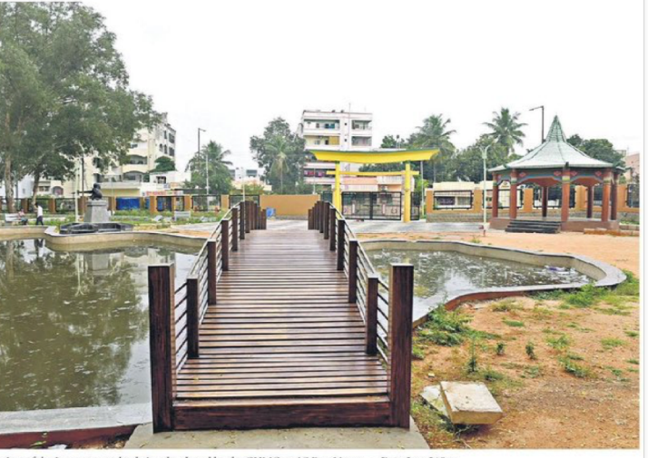
A view of the Japanese garden being developed by the GHMC at AS Rao Nagar.

rcle), adding that the even ore being opened, the was already a hit residents of Secun-