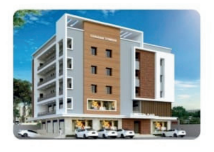
SECUNDERABAD STATION ROAD Commercial Complex Shops and Hotel 40 Rooms