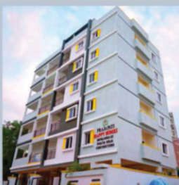
Prajapati Happy Homes @Ameenpur