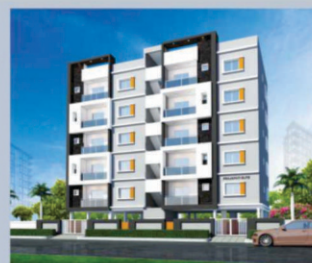
Prajapati Elite @KRCR Haritha Vanam Colony, Bachupally.