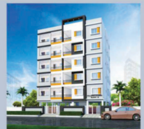
Prajapati Classic Block - B @KRCR Haritha Vanam Colony, Rd No: 5, Bachupally

NOTE : This brochure is only a conceptual presentation of the project and not a legal offering. The promoters reserve the right to make change in the elevation, plan and specifications as deemed fit.