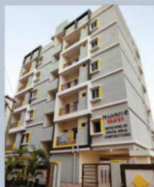
Prajapati Heaven @Bachupally